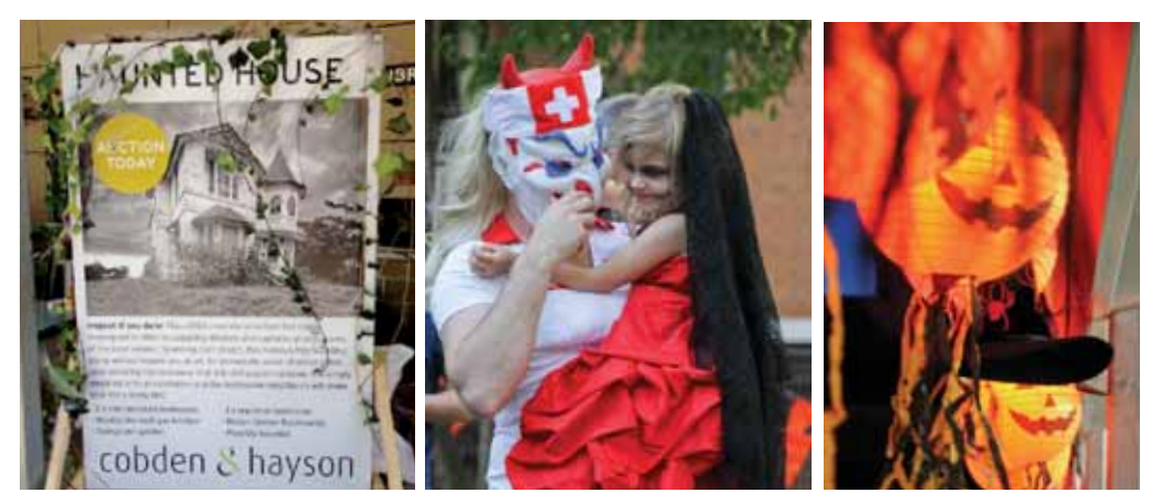
Members of the community take part in the Halloween celebrations, including the Haunted House.

Balmain agency Cobden & Hayson actively invests in its community, but one of the events it sponsors is rather frightening.